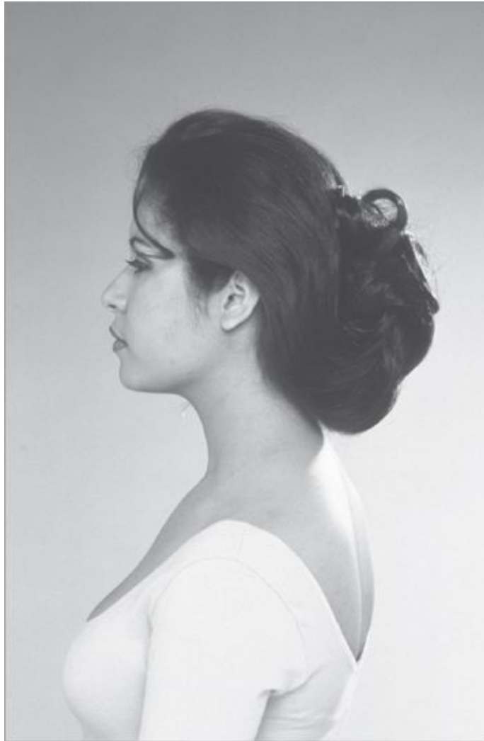
C. W. Bush / Shooting Star