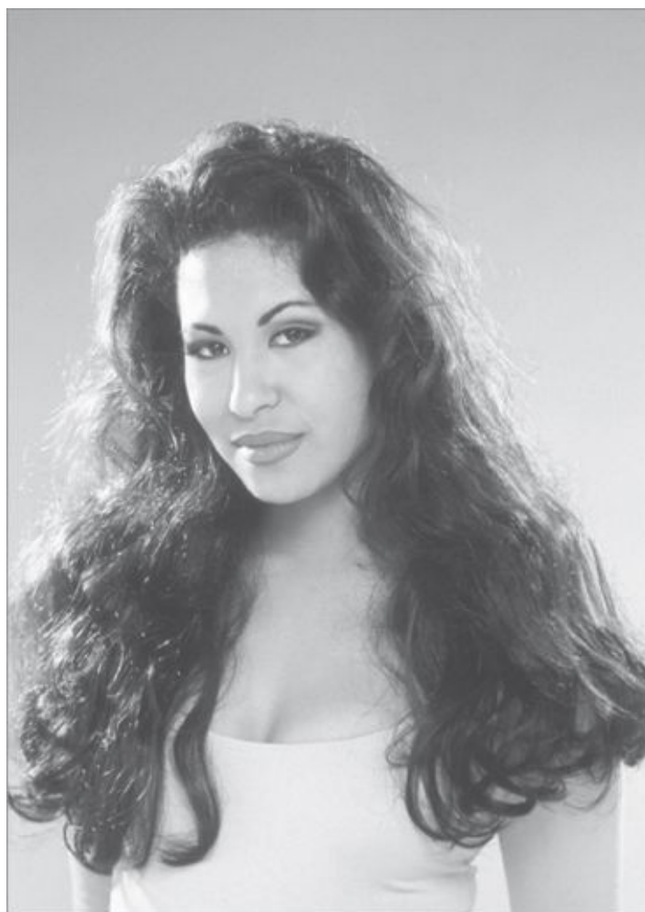
C. W. Bush / Shooting Star